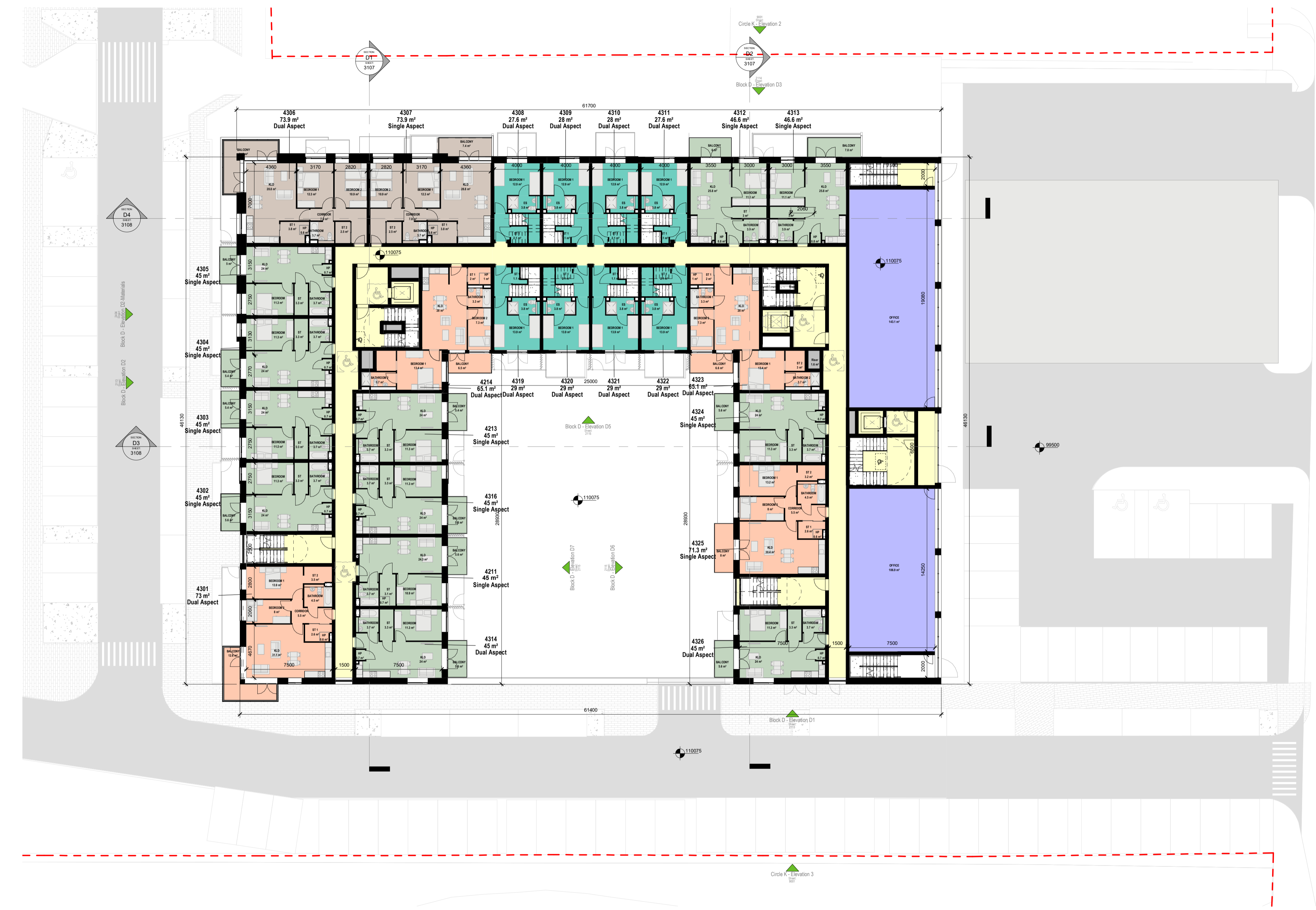
1 Plan - Block D- Level 03 1:200

Please consider the environment before printing this sheet